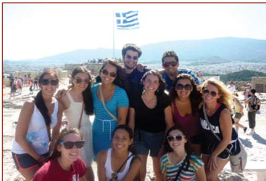
Hellenic Birthright participants at the Acropolis for the first time.