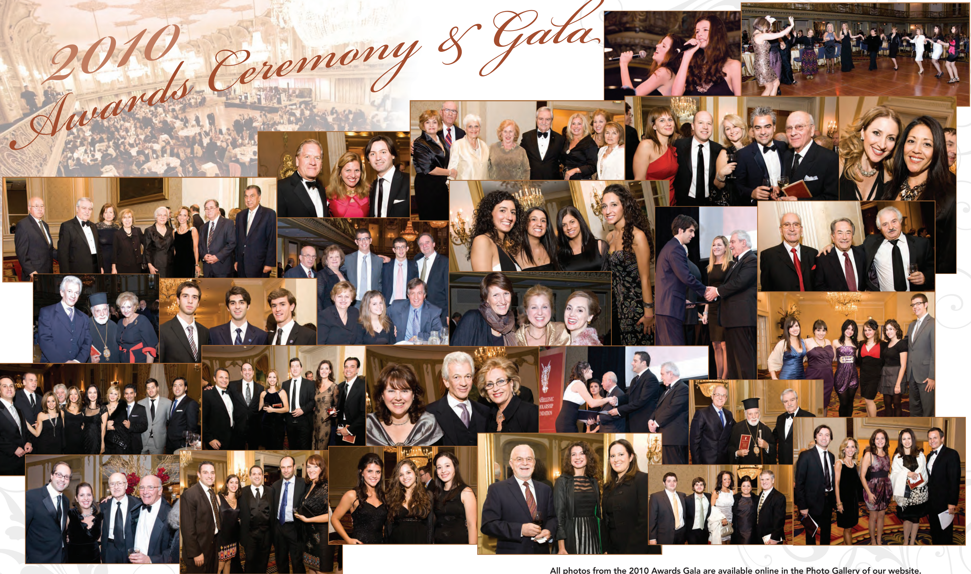
All photos from the 2010 Awards Gala are available online in the Photo Gallery of our website.